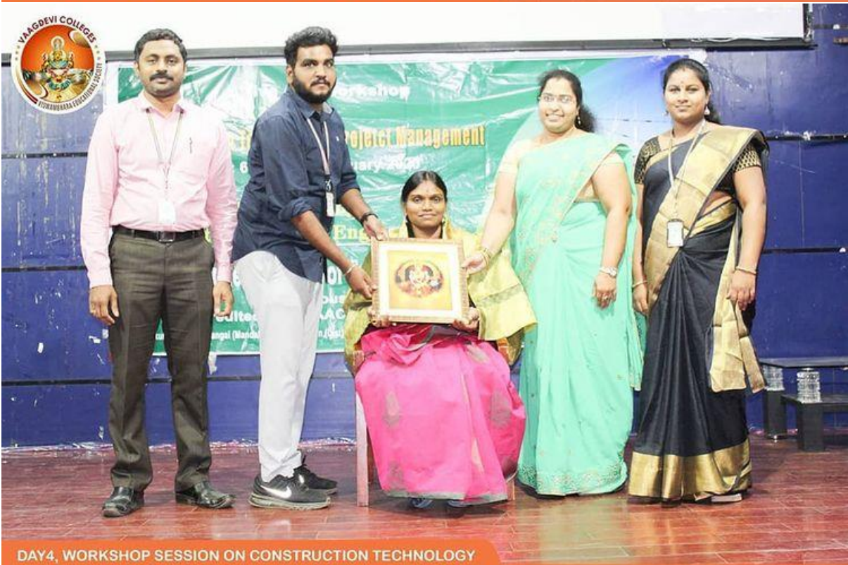
DAY4, WORKSHOP SESSION ON CONSTRUCTION TECHNOLOGY