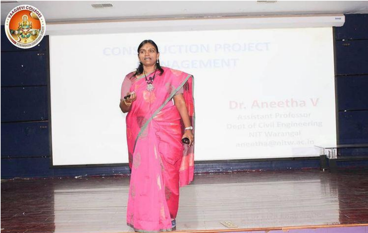
DAY4, WORKSHOP SESSION ON CONSTRUCTION TECHNOLOGY